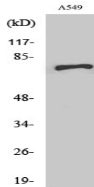
Western Blot analysis of various cells using SCFD1 Polyclonal Antibody