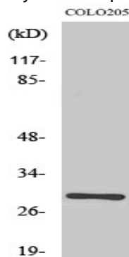
Western Blot analysis of various cells using Rab 6C Polyclonal Antibody

Western blot analysis of lysates from COLO cells, using RAB6C Antibody. The lane on the right is blocked with the synthesized peptide.