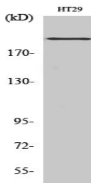
Western blot analysis of BRCA1 in HT-29 lysates using BRCA1 antibody.